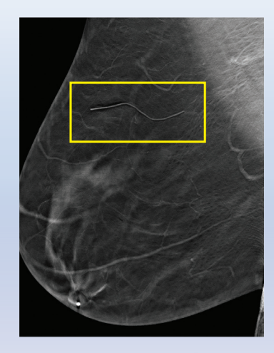
Line = Surgical Scar