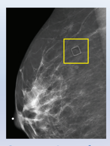
Square = Area of Concern or Pain