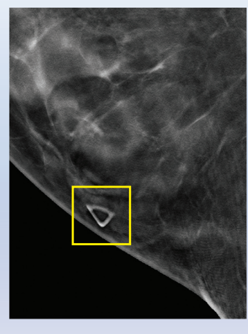
Triangle = Palpable Mass