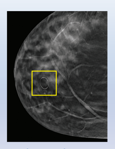
Circle = Mole